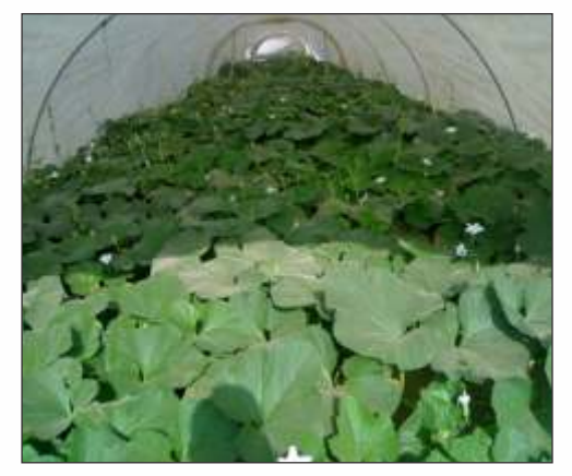
Bottle gourd in December