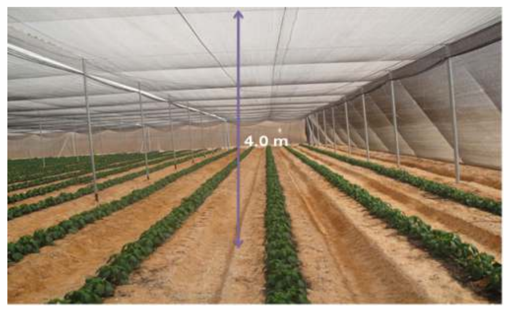
Capsicum crop under permanent silver colour shade net house