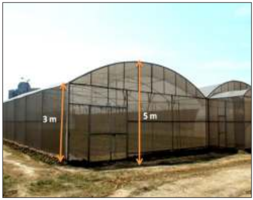
Permanent Insect proof net house in greenhouse design