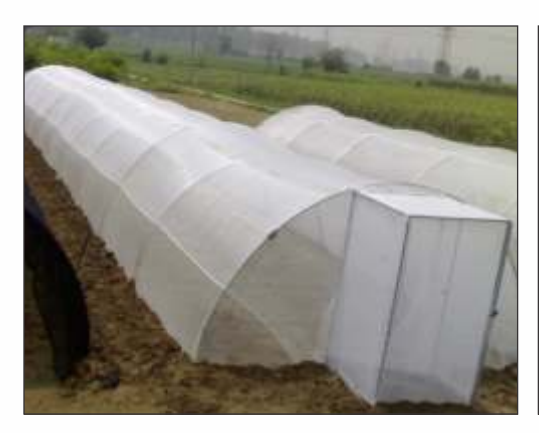
Rectangular shaped permanent insect proof

net should be UV stabilized. It has been experimentally established that under these double door net houses crops like sweet pepper, tomato, chilli, brinjal, okra and others can be grown successfully without infestation of viruses or insects like fruit and shoot borer etc. Moreover, growers can save the huge amount spent on pesticides to control the insect/pests