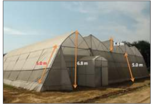
Multi-span Naturally Ventilated Green/Polyhouse