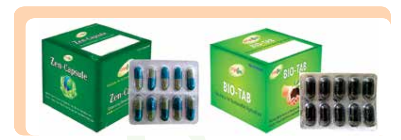
Fig.8. Innovative fertilizer and pesticide formulations in tablet and capsular forms