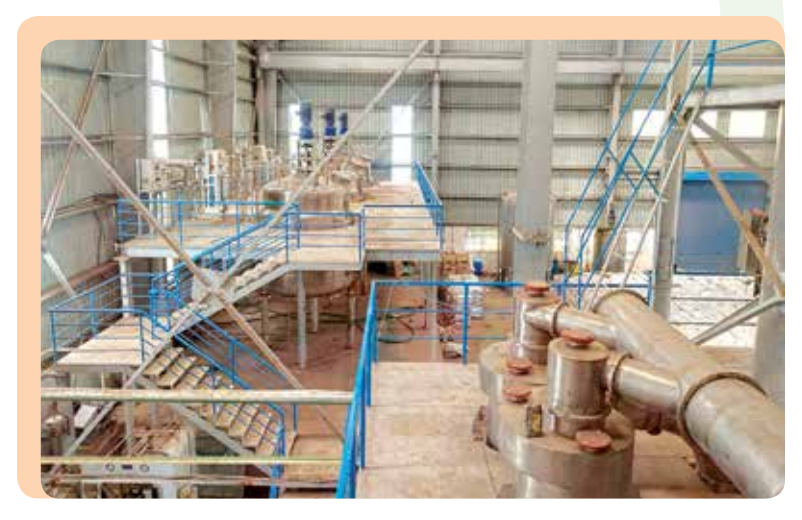
Fig. 6. The fermentation unit with large capacity fermenters

riyagen today is a well recognized state-of-the-art production as well as R&D center with some of the best equipments, such as the automated soil testing equipment which very few such laboratories in the whole state own, and three 15 kl capacity fermenters (Fig.6), spray dryer and granulator for production of various formulations of biofertilizers and biopesticides in solid, liquid and granular forms. Bio-NPK is a microbial formulation containing strains of bacteria which are able to synthesize/ assimilate atmospheric nitrogen, solubilize phosphate and potash into available form, thereby supplementing balance nutrition to crops. It