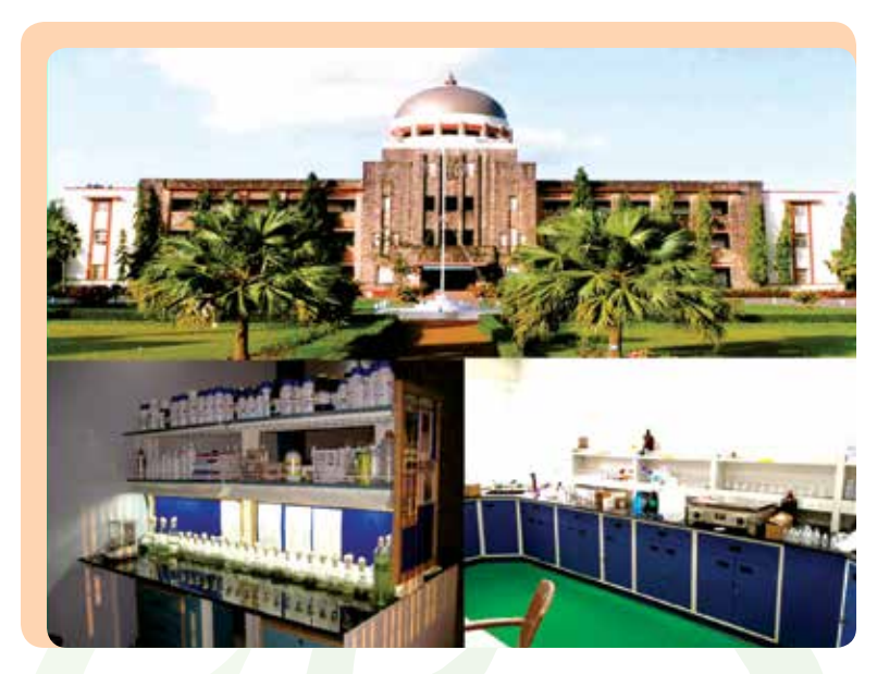
Fig. 1. Criyagen incubation center at UAS, Dharwad

was just then in the process of developing its wine policy based on the model adopted by the neighboring Maharashtra State. Vijayapura and Bagalakote are grape growing hubs of Karnataka and he wanted to tap the potential of the nascent industry as Plan B in case the cynicism of family and friends turned out to be true. As a result of his hard work, concerted efforts, sincerity and support from family as well as a committed team with strong will power, he has achieved success in both his business plans and today is on the verge of reaching higher echelons.