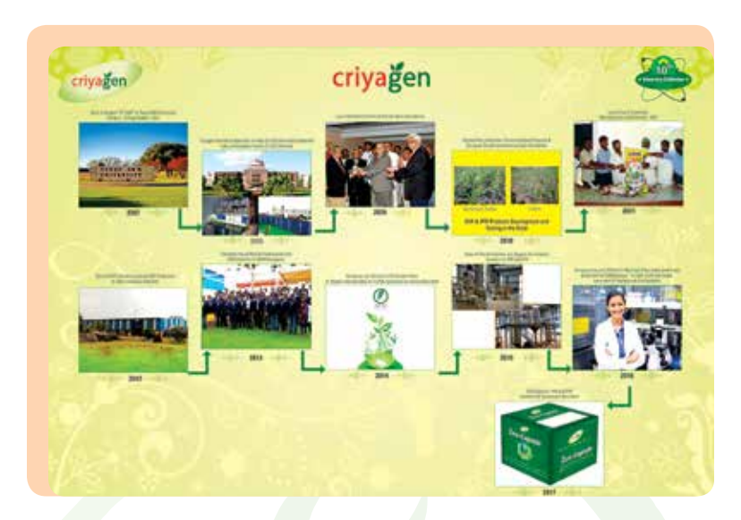
Fig. 14. A pictorial nutshell of Criyagen's activities and progress

from experts and well wishers, which has also contributed towards the steady success. Timely help from financial institutions for funding and support have given a fillip to the establishment of infrastructure and state-of-the-art laboratories. Criyagen provides direct employment to 125 personnel, including marketing staff in Karnataka and other states of India such as Maharashtra, Andhra Pradesh, Haryana and Tamil Nadu. It also provides employment to 100 farm laborers through a contract system.